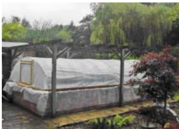
Rocky's poly tunnel, newly erected over the pond.

We have recently erected a poly tunnel over the pond (see picture) to help prevent wind chill and to preclude rainwater and also ice forming on the pond. We hope to see a difference in our koi this spring. Fingers crossed.