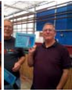
Some very happy koi keepers

To round off the day we all gathered over the road from Worthing Aquatics at the Spotted Cow for a Sunday roast and with a full belly returned to Worthing Aquatics for bagging up. We all have a commitment to look after and encourage the growth of our new kohaku. Now let the race commence!