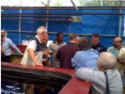
Ready, steady, GO!!

Members met up at Worthing Aquatics on Sunday 19th July to take part in the club's Show & Grow competition.